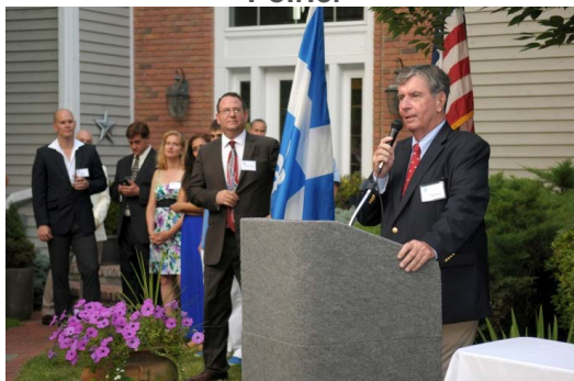
Senator Neil Breslin