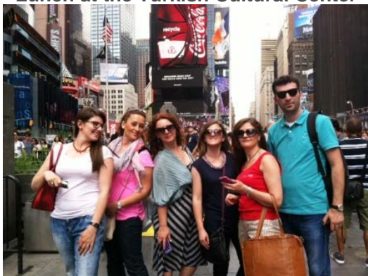
Visiting Times Square