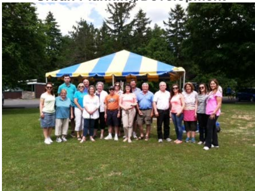
Welcoming picnic at Thatcher State Park

engaging in activities to learn about American society and values to experience life in a democratic society. The program places special emphasis on leadership skills and seeks ways for participants to develop these skills during the school year. As former Senator Bill Bradley stated, "the best way to ensure long-lasting peace and understanding between the U.S. and Eurasia is to enable young people to learn about democracy firsthand through experiencing it". The International Center is hoping to place three students within the Capital Region this coming academic year. If you would possibly consider hosting a student for part of or for the full school year, we would like to hear from you.