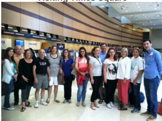
Departing from Albany International Airport

NOTE: The Open World Leadership Center administers the Open World program, one of the most effective U.S. exchange programs for countries of the post-Soviet era. Begun as a pilot program in 1999 and established as a permanent agency in late 2000, the Center conducts the first and only international exchange agency in the U.S. Legislative Branch and, as such,