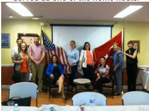
Lunch at the Turkish Cultural Center