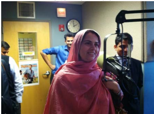
A Visitor from Pakistan making a public