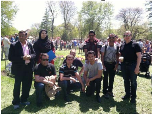
The group enjoying Tulip Festival in Washington Park.