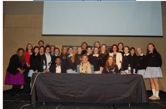
Academy of Holy Names