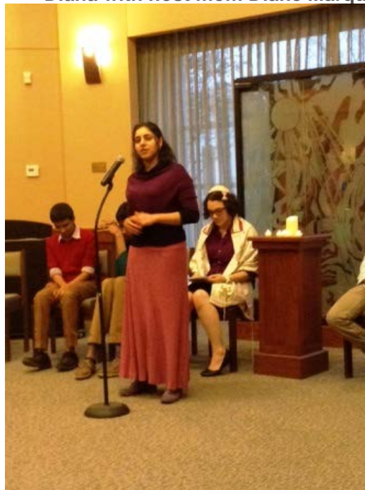
A good time was had by all at the FLEX group's farewell party on a beautiful May day