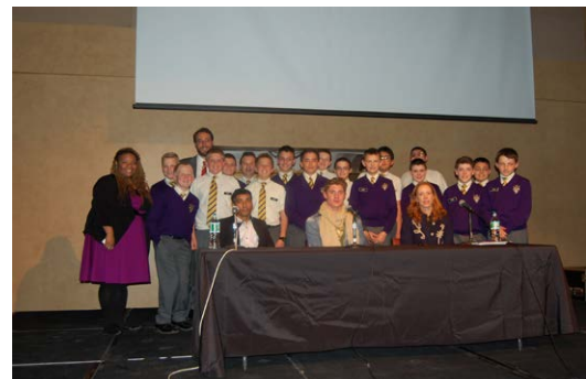
CBA - Christian Brothers Academy