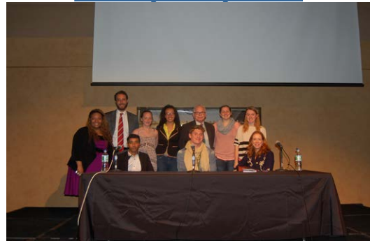
Heatly High School (Green Island)