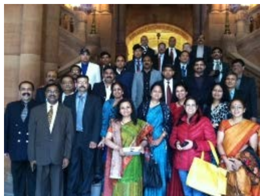
The group posing for photos on the Million Dollar Staircase in the NYS Capitol

On May 22 nd , ICCR hosted its half-year appreciation reception with a breakfast at the Albany Visitors Center. The grateful Staff and Board of Directors of the International Center invited all our supporters to attend. Because of them and their involvement with our programs and initiatives, we continue to grow.