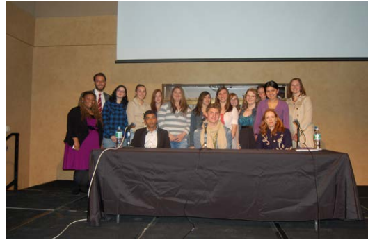
Hoosic Valley High School