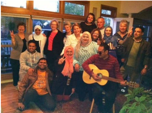
A wonderful evening of Home Hospitality with the help of several ICCR Board Members and Supporters