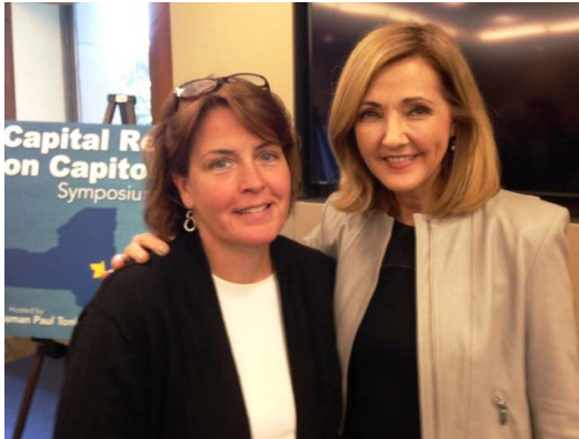
Chris Jansing, Senior White House Correspondent, gave the keynote address