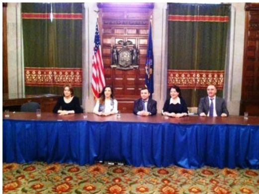
Visiting the NYS Governor's office

Promoting Transparency, Accountability and Ethics in Government (Armenia)