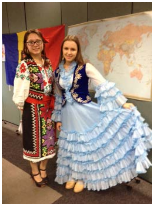
2 of our FLEX students enjoy sharing their culture

The Sound of the Trumpets, the Roll of the Drums Monday, May 5 at 7pm $6 general public / $3 students, seniors & UAlbany faculty-staff - Main Theatre The University-Community Symphonic Band and the University Percussion Ensemble present a shared concert.