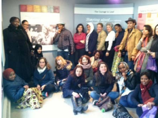
Visiting Val-Kill in the Hudson Valley