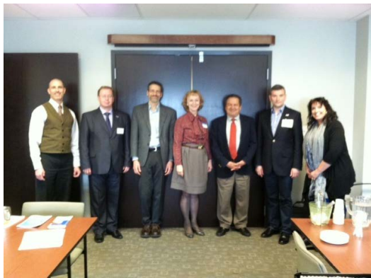
Visiting the American Cancer Society and Hope Club in Latham