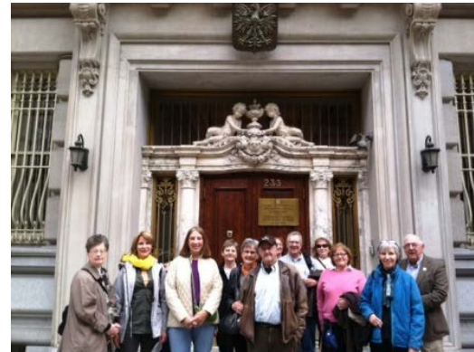
Consulate in Manhattan

On Friday, April 11, 2014, sponsored a Day of Poland & Polish-American Heritage in New York City. The group visited the Polish Consulate, a Polish parish and spent time in Greenpoint ("Little Poland"). Fun was had by all!