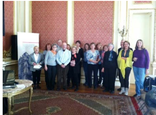
The group inside the beautiful Polish Consulate in NYC