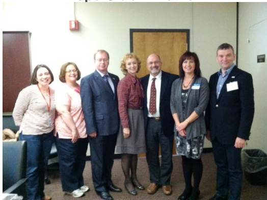
At NYS DOH Bureau of Tobacco Control ***