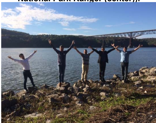
Enjoying the scenery along the banks of the Hudson River in Poughkeepsie. (the Walkway Over the Hudson is in the background)