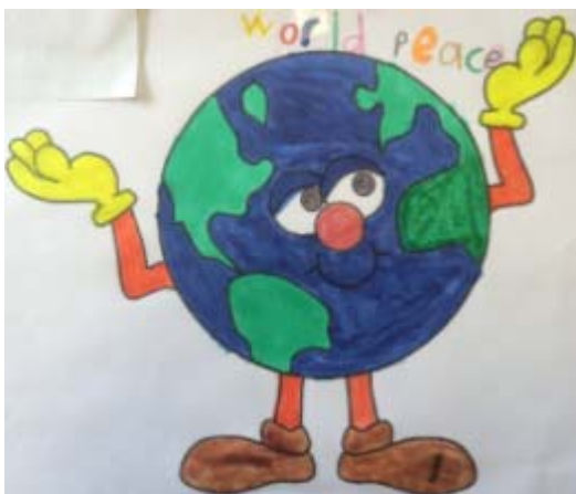
ICCR's Coloring Contest Winning Submission

Space is limited. To make a reservation, please call ICCR at (518) 708-7608 or email, info@iccralbany.org .