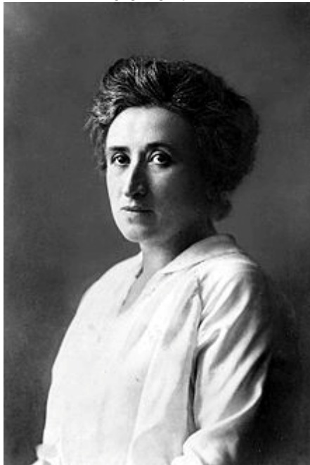
Rosa Luxemburg (1871-1919)

“Without general elections, without unrestricted freedom of press and assembly, without a free struggle of opinion, life dies out in every public institution, becomes a mere semblance of life, in which only the bureaucracy remains as the active element.”