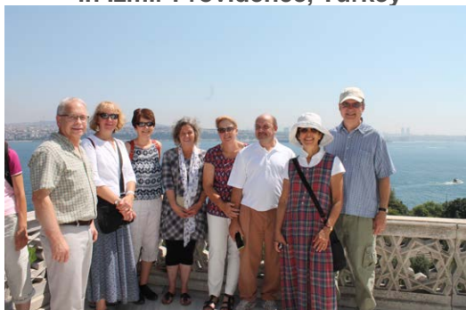
The group visiting the Topkapi Palace, in Istanbul Turkey, which was the primary