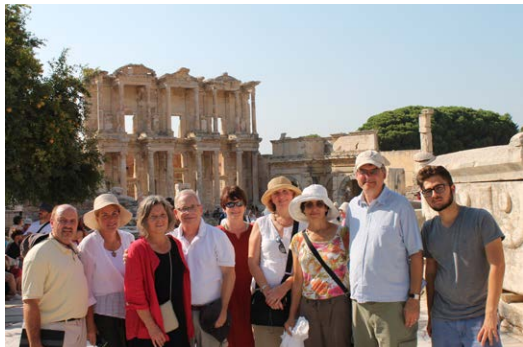
The group standing in front of the Library of Celsus in Ephesus, an ancient Greek city located in Izmir Providence, Turkey

Thank you to the Turkish Cultural Center Albany (TCCA)! www.turkishculturalcenter.org/category/tcc-albany