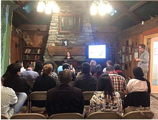
The Adirondack Council speaking to the visitors about the state of New York's "Forever Wild" Clause

different countries arrived September 14th to explore New York's conservation efforts with the wildlife and forests.