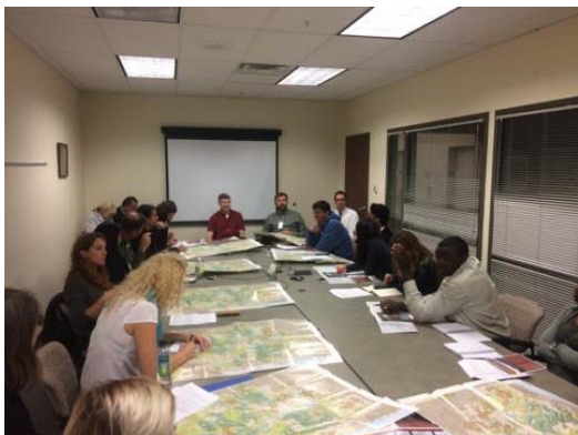
Below the group explored the different land classifications of the Adirondack Park with the Department of Conservation in Albany

from 20 different countries traveled north to Lake Placid to learn about the conservation efforts done by organizations such as the Adirondack Council, Adirondack Park Agency, Department of Conservation, Paul Smith's College, The Adirondack 2 Adirondack Collaborative, The Wild Center, the Adirondack Local Government Review Board and more!