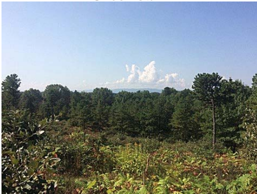
The beautiful Albany Pine Bush atop their highest sand dune.