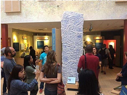
The group exploring the Albany Pine Bush. Just in this picture alone we have visitors from China, India, Mexico, Mozambique, Hungary, and Uzbekistan.