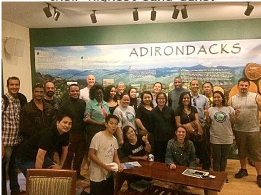
Though the rain started to come down spirits were high as they just finished their guided canoe trip of